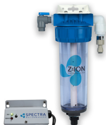
Z±ION System Protection, Manual Z±ION-MAN

Spectra Watermakers reserves the right to modify products