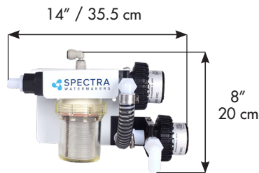
Sea Strainer and Boost Pump Depth 4" / 10 cm