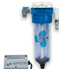
Z±ION System Protection, Automated Z±ION-AUTO

Katadyn reserves the right to modify products