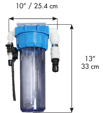
Charcoal Filter Depth 6" / 15.2 cm