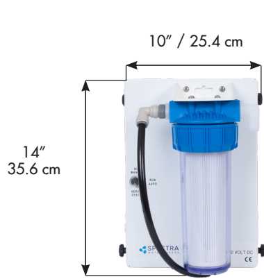
Feed Pump Module Depth 4.5" / 11.4 cm