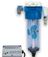
Z±ION System Protection, Automated Z±ION-AUTO

Katadyn reserves the right to modify products