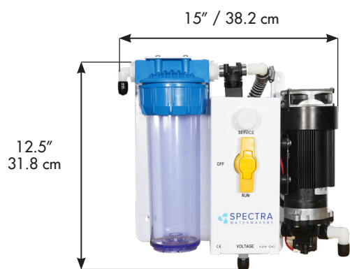
Feed Pump Module Depth 4.5" / 11.4 cm