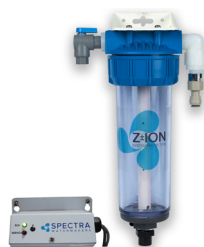
Z±ION System Protection, Automated Z±ION-AUTO

Katadyn reserves the right to modify products