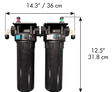
Pre-Filters Depth 6" / 15.2 cm