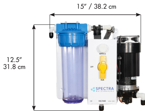
Feed Pump Module Depth 4.5" / 11.4 cm