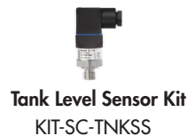
Tank Level Sensor Kit KIT-SC-TNKSS