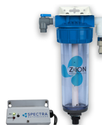
Z±ION System Protection, Automated Z±ION-AUTO

Katadyn reserves the right to modify products