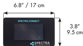
Spectra Connect Display Depth 1" / 2.5 cm