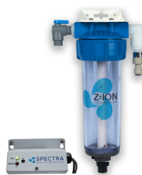
Z±ION System Protection, Automated Z±ION-AUTO

Katadyn reserves the right to modify products