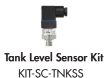
Tank Level Sensor Kit KIT-SC-TNKSS