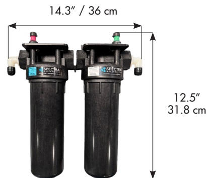
Pre-Filters Depth 6" / 15.2 cm