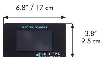
Spectra Connect Display Depth 1" / 2.5 cm