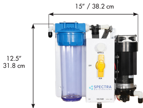
Feed Pump Module Depth 4.5" / 11.4 cm