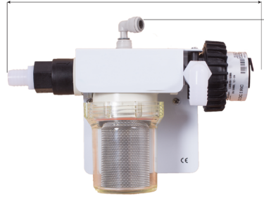
Feed Pump Module Depth 4.5" / 11.4 cm